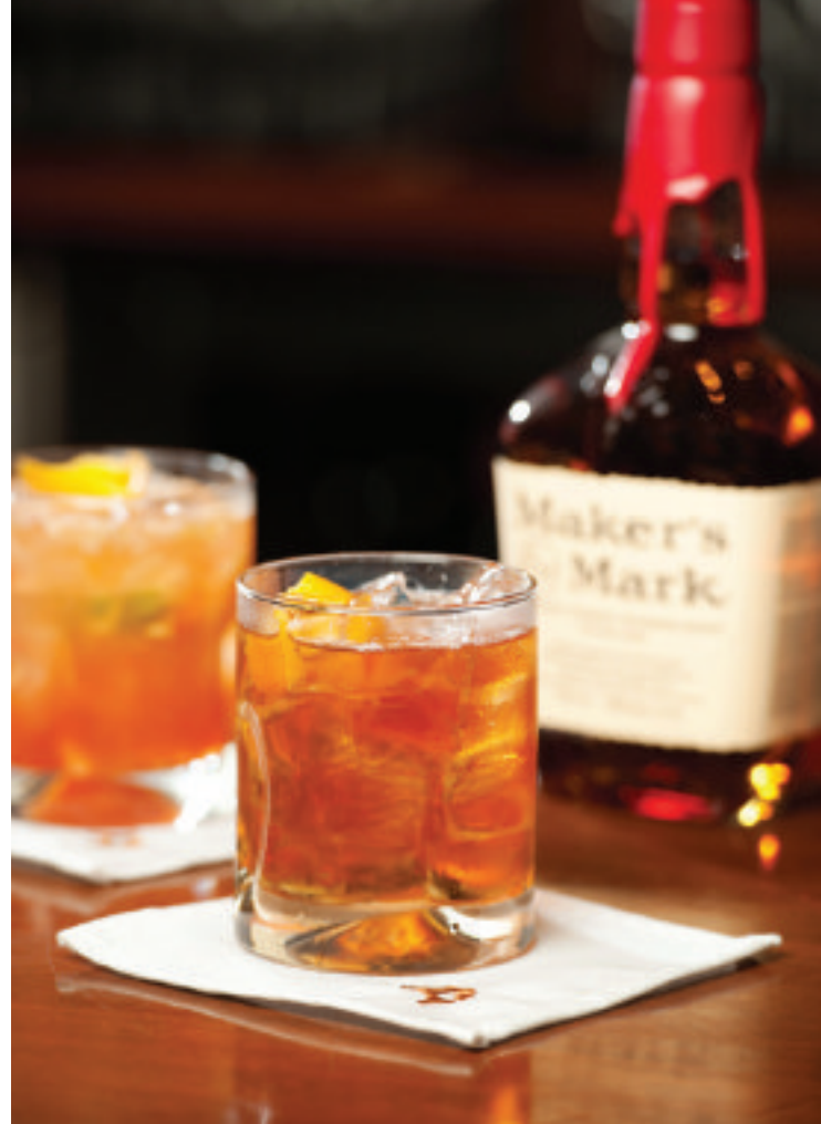
Right: The Old Fashioned from Hy's Steakhouse, topped with fruit slices.

"I don't like muddling. I think muddling is a waste of time," he says, recalling that after he won bartender of the year in Pique Newsmagazine's Best of Whistler competition, he was asked what his best drink was.